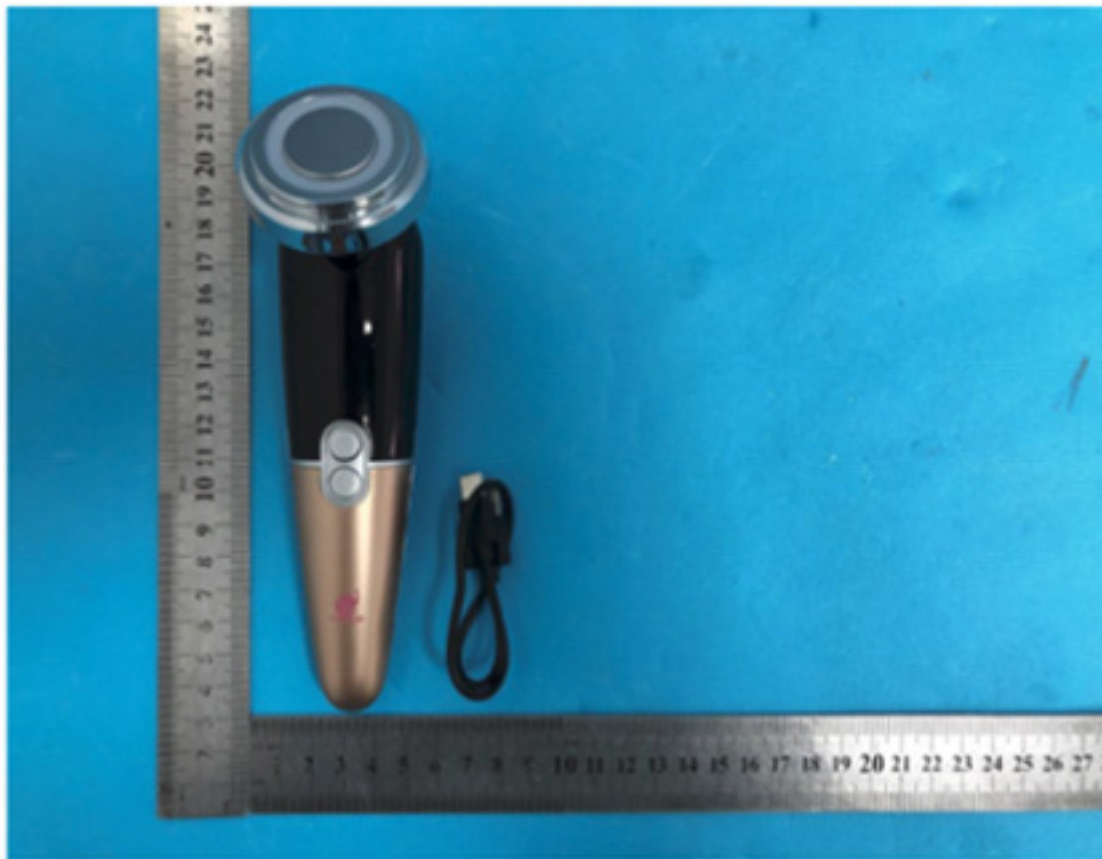
All view of EUT