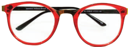
IonSpec M91 - Red Black