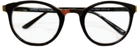
IonSpec M91 - Full Black