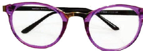
IonSpec M91 - Violet Black