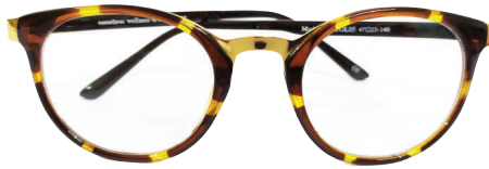
IonSpec M91 - Leopard Black