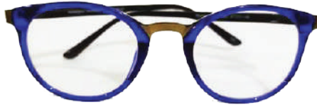
IonSpec M91 - Blue Black