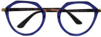
IonSpec M92 - Blue Black