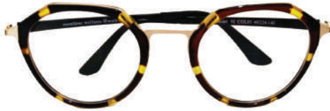
IonSpec M92 - Leopard Black