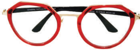
IonSpec M92 - Red Black