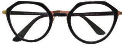
IonSpec M92 - Full Black