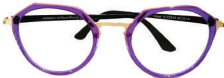
IonSpec M92 - Violet Black